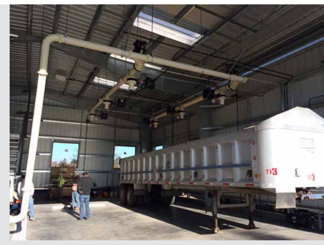
Even distribution of sludge into trailer

After considering these issues, the District selected progressing cavity pumps as the preferred option for transporting the sludge cake. Working with local pump distributor Flo-Line Technology, the District sought to take advantage of NETZSCH's