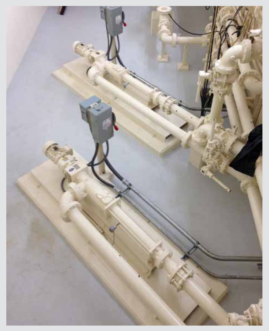
NEMO® BY progressing cavity pumps for belt filter press feed.

The District had several issues with the existing conveyor system. The first issue is the difficultly in moving the sludge cake to more than one location. Trailers are 30 or 40 feet