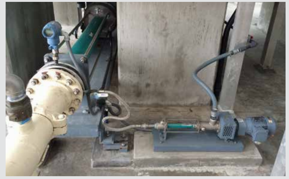
Polymer injection - NETZSCH FLR system reduces friction losses

reduction (FLR) system, which consists of a small NEMO<sup>®</sup> progressing cavity pump that injects a layer of polymer along the inner diameter of the pipe which allows the sludge to move more easily.