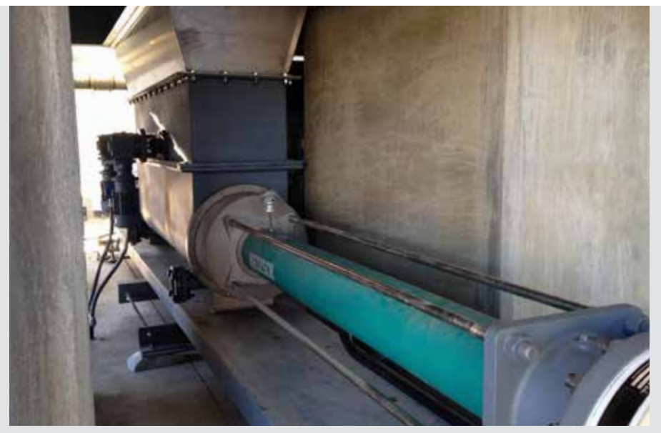
District ultimately selected the NEMO® SF Sludge Cake Progressing Cavity Pump